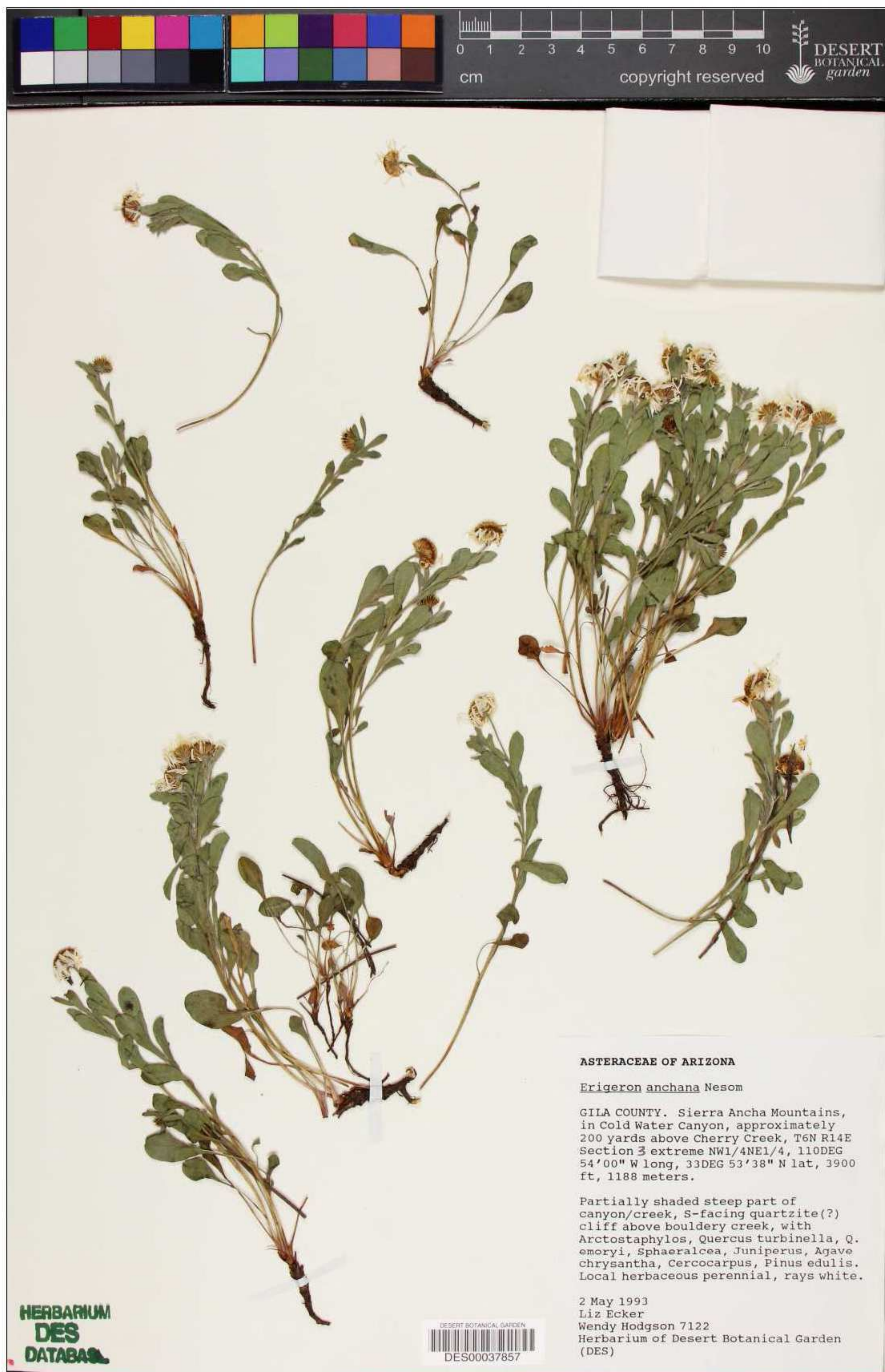
Figure 3. Erigeron hodgsoniae , Hodgson 7122, DES.